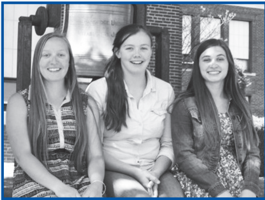
Associate Degree Candidates

Best wishes ladies in your future endeavors!